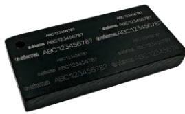
Marking on acetate