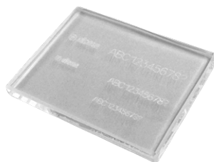
Marking on glass