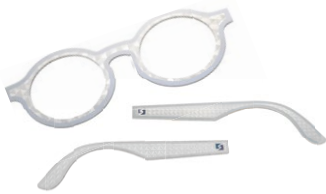
Fill-it on metal