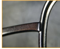
Repair of metal eyewear components