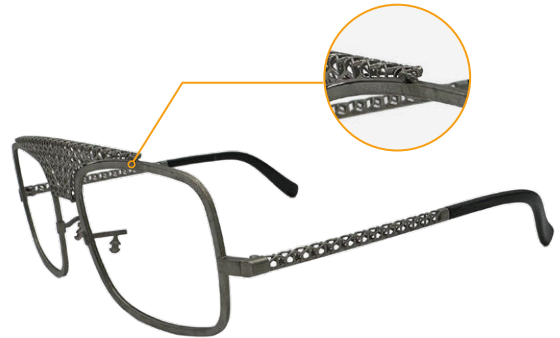
Assembly by means of welding